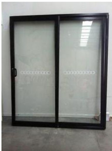
SLIDING DOORS (White Coloured)