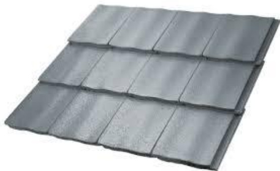
CONCRETE TILES ROOF TO MATCH EXISTING DWELLING